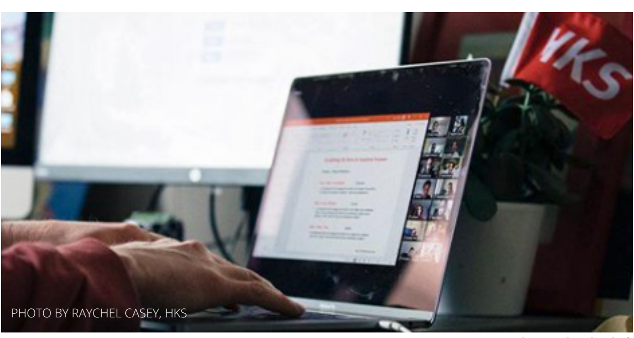
Harvard Kennedy School 4